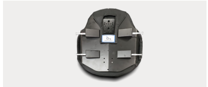
Rear Back Angle