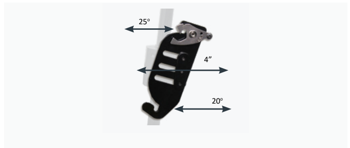
Accommodates Pelvic rotation and will allow for full back support with 25° of posterior and 20° of anterior adjustability.