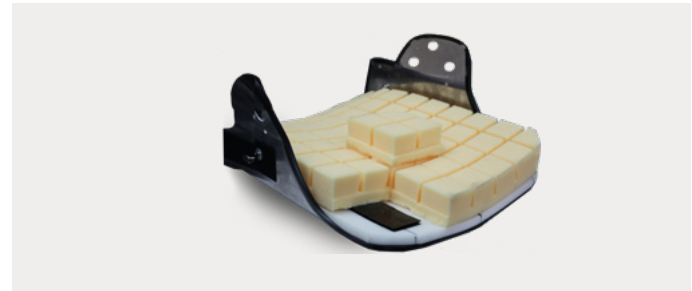
Inner Foam and Incontinent Cover

Power Plus Mobility's advanced machinery specializes in manufacturing custom parts to customers' specifications from either a drawing or a sample. The parts we manufacture can be simple or more complex and can be manufactured in small or large quantities. Contact your local sales representative with your specifications.