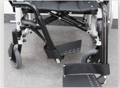
Swing In And Swing Out Front Rigging