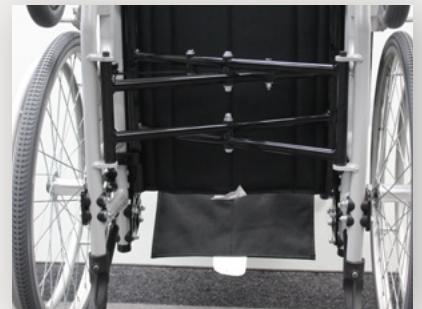
Dual Cross Braces