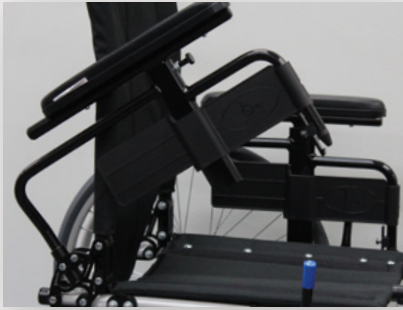
Two Point Flip Back Arm