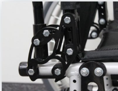
Angle Adjustable Back Canes 0°, 5°, 10° Or 15°