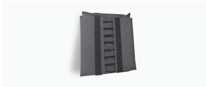
Rear straps can be adjusted to the curve of the spine