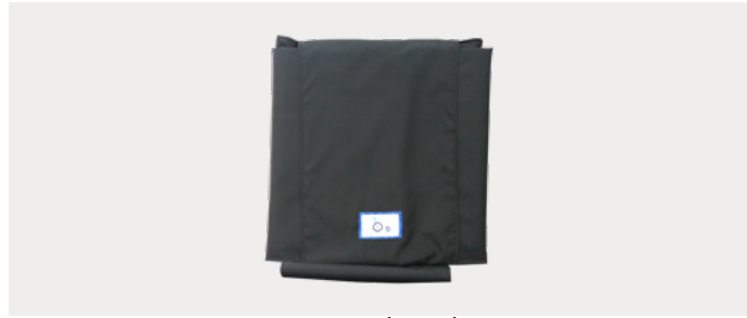
Rear Back Angle

Power Plus Mobility's advanced machinery specializes in manufacturing custom parts to customers' specifications from either a drawing or a sample. The parts we manufacture can be simple or more complex and can be manufactured in small or large quantities. Contact your local sales representative with your specifications.