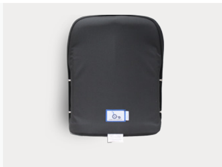
Rear Back Angle

X = Standard shell height 18" Y= Lateral depth 3" finished Z= Lateral height 10"