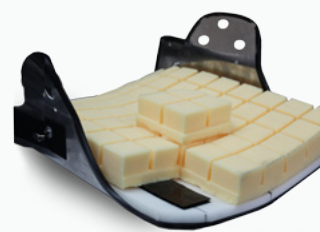
Inner Foam and Incontinent Cover