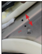
BACK PIN POSITIONS ADJUSTABLE HOLES

Accommodates Pelvic rotation and will allow for full back support with 25 degrees of posterior and 20 degrees of anterior adjustability.