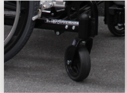
Angle Adjustable Front Journals