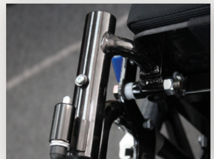
Offset Front Hangers (Optional)