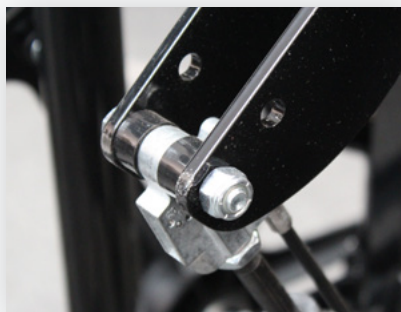
Zero Maintenance Soft Set Cylinders