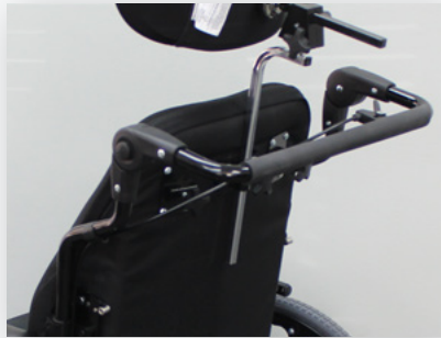
Standard Angle Adjustable Stroller Handles