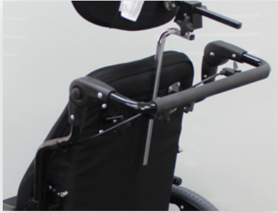
Standard Angle Adjustable Stroller Handles