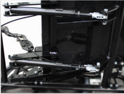
Dual Cylinders Allows For Consistent Tilt For All Weight Capacities