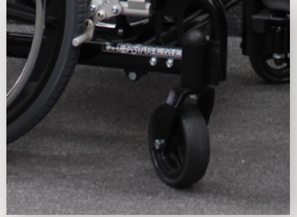
Angle Adjustable Front Journals