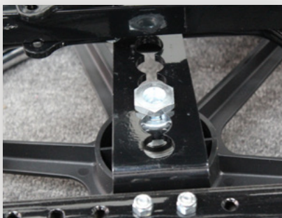
Seat To Floor Height Adjustability