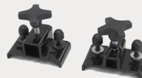
Standard Headrest Hardware Diagram 6