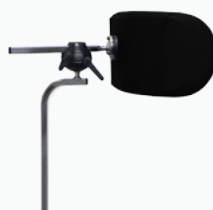
Contoured Headrest Diagram 1