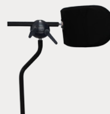
Multi Axis Headrest Diagram 2