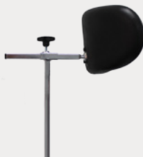
Complex Headrest Diagram 3