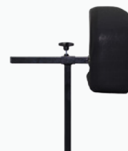
Vertical Horizontal Headrest Diagram 4