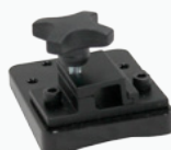
Universal Headrest Hardware Diagram 5