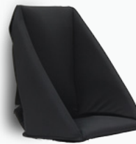
One Piece Foot Box Diagram 2