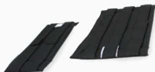
Foot Pocket Not Padded Diagram 3