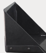
One Piece Double Foot Box Not Padded Diagram 4