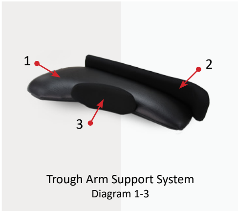
Trough Arm Support System Diagram 1-3