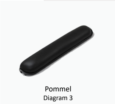
Pommel Diagram 3