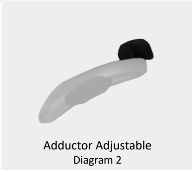
Adductor Adjustable Diagram 2