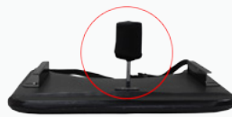
Pommel Diagram 3