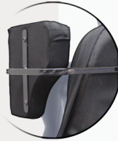
Tapered Lateral Left Diagram 1