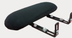
Adductor Adjustable Diagram 2