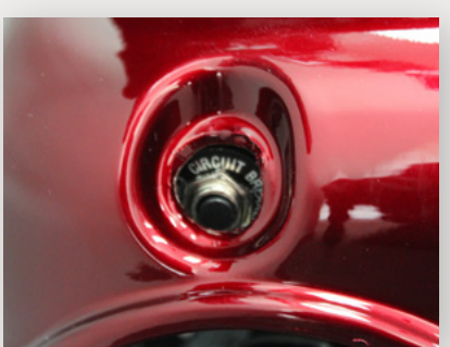
On Board Circuit Breaker