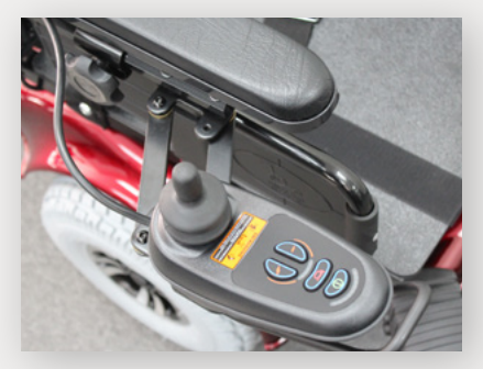
Single Drive PNG Joystick