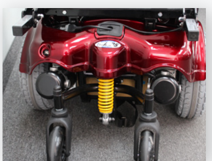
Adjustable Rear Suspension