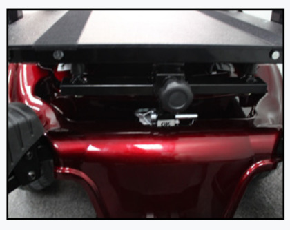
Height And Depth Adjustable Seat Package