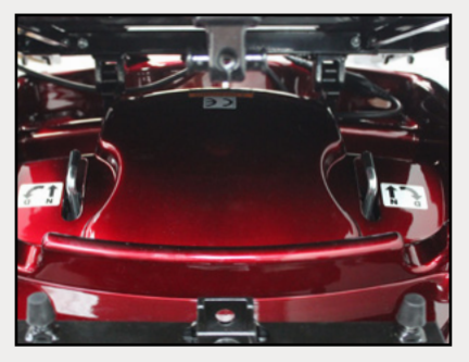
Neutral Levers To Manually Maneuver Power Chair