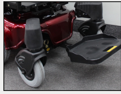
Standard Flip Up Foot board