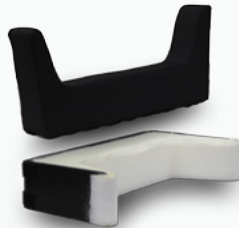
Pelvic Stabilizer Wedge Diagram 2