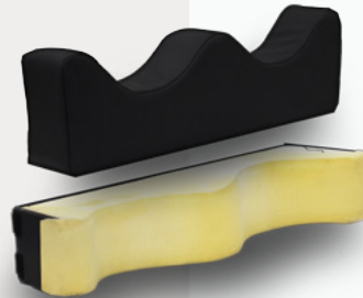
Drop Base Diagram 1