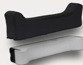
Adductor Adjustable Diagram 3